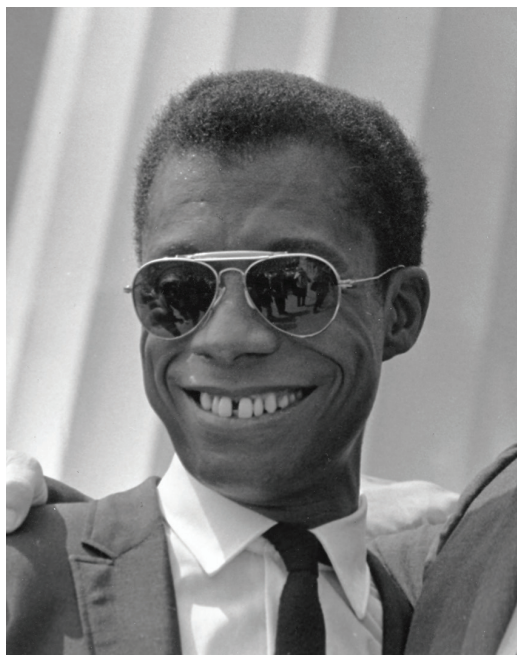
James Baldwin at the 1963 March on Washington for Jobs and Freedom

tolerance.org/classroom-resources/lessons